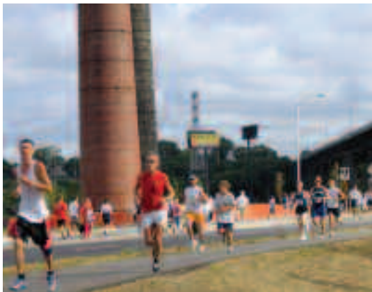
Hank Aaron State Trail Run/Walk