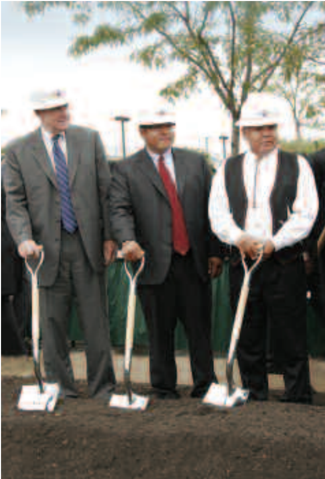
POTAWATOMI BINGO CASINO

In 2006 Harley-Davidson unveiled designs and broke ground for the Harley-Davidson Museum to be located at 6th & Canal Streets. Anticipated to open in 2008, the 130,000 square foot Museum development will feature exhibit space as well as a restaurant, café, retail shop, meeting space, special events facilities and the company's archives. When completed, it is anticipated an estimated 350,000 visitors annually from around the world will come to celebrate the rich history of Harley-Davidson.