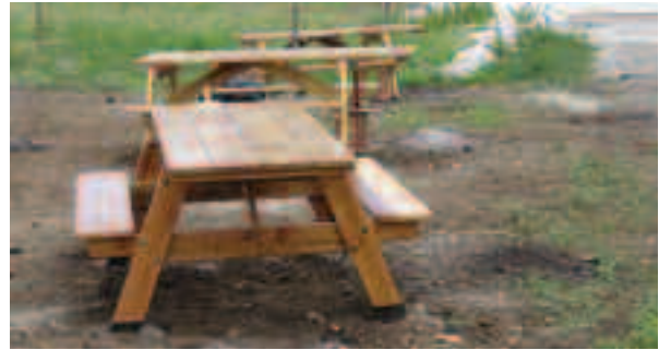
Reclaiming Stockyards wood for Park's picnic tables