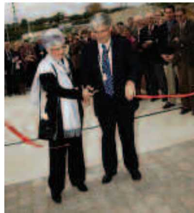
Palermo's Grand Opening