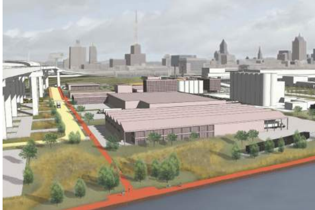
Looking northeast at a conceptual FaB development with canal side access.