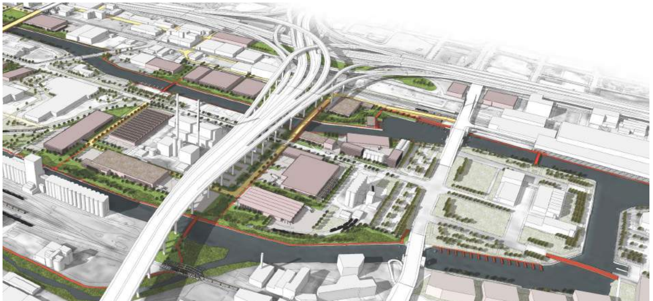
A built out and fully connected valley FaB District